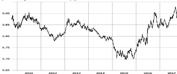
Fig.1 Pound to euro exchange rate 2011-2017

In fact, economic growth in the UK is not that considerable, just some 1.8% - 2%. Another problem is that the country's debt has risen to around 90% of the GDP and it is expected to grow to 93% by the end of 2018 [4]. Furthermore, in June 2017 the inflation rate rose to 2.9%, so it is obvious that after paying the exit bill (€40-50 billion) and obtaining new terms of trade, traveling and doing business in the EU, no one is sure they might keep economic growth from falling below zero. The negative percentage difference of the pound against the euro since the referendum was around 10% at the end of 2015 and the beginning of 2016 (Fig.1). Overall predictions are not that optimistic, so the government is implementing steps to protect the national economy, although the result is only provisional.